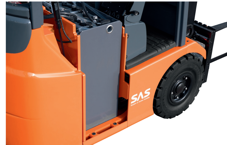
Standard low lift-out battery extraction. Built-in rollerbed for fast changes optional.