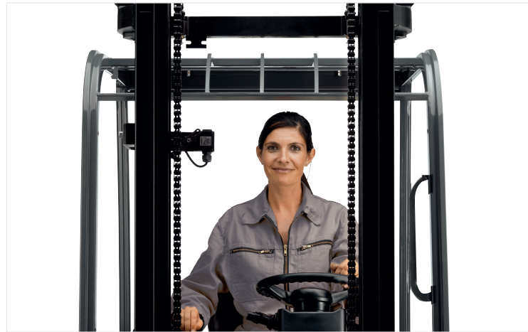
The clear-view mast gives operators an excellent view to the load and working environment.