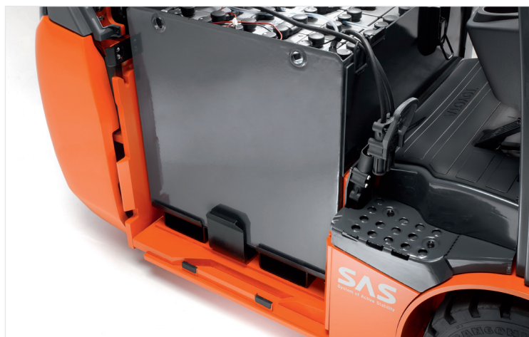
Battery side extraction with fork pockets (shown) or built-in rollerbed.