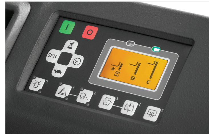
Lift height presetting saves time and effort for the driver.