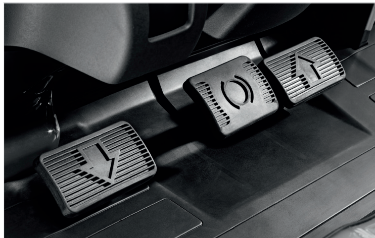
Different pedal layouts to suit driver preference. (Double pedal layout option shown)