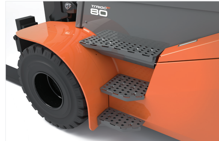
Large entry window with wide steps and double driver assist grips ensure fatigue is minimised in applications that require repeatedly getting in and out.