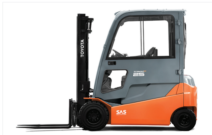
Cabin options provide weather protection, increased comfort and enhanced safety.