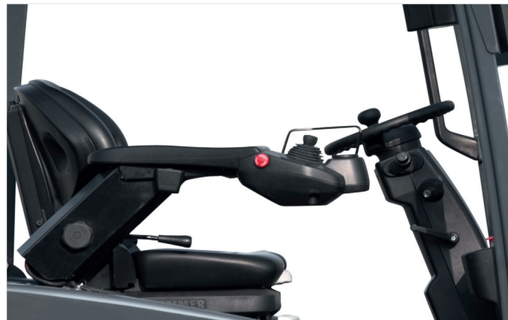
Mini-levers in the armrest offer smooth, fingertip control of lift, lower, tilt and side-shift functions.