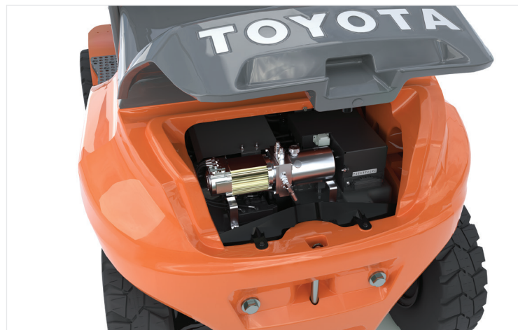
Easy access to main service components.