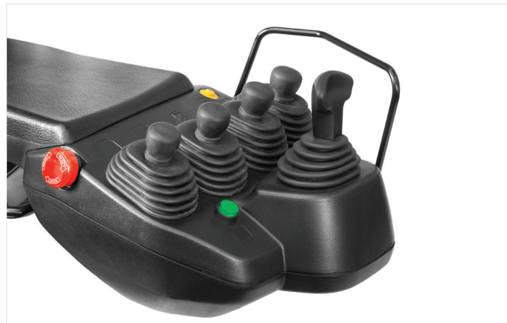
Minilevers in the armrest are intuitive and easy to use.