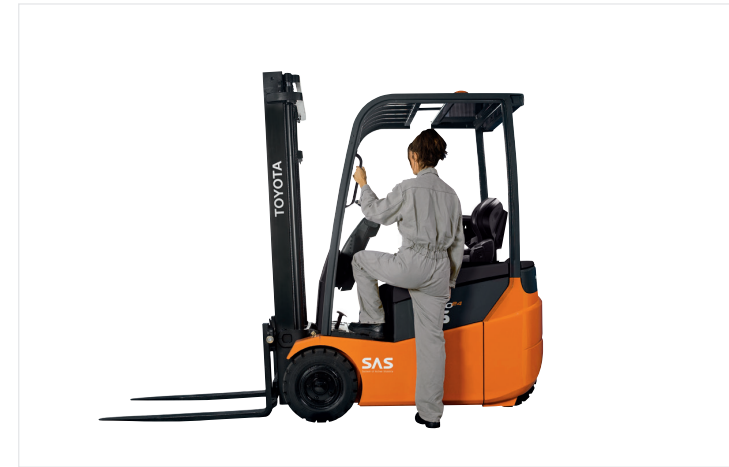
Low step-in height makes it easy for any driver to access the truck.