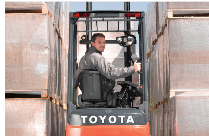
Rear-assist grip enhances reverse travel comfort and productivity by reducing operator back strain. Optional swivel seat facilitates reversing and getting in and out.