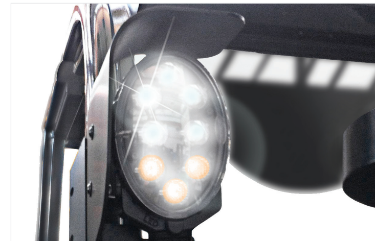
Powerful and efficient LED working lights allow work to continue in unlit areas or at night.