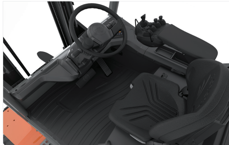
The spacious full floating driver compartment with minimal vibration and low noise offers the driver a comfortable work space.