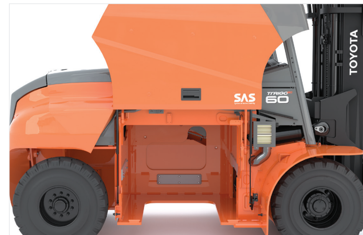
Open chassis design with side panel facilitates lateral battery exchange.